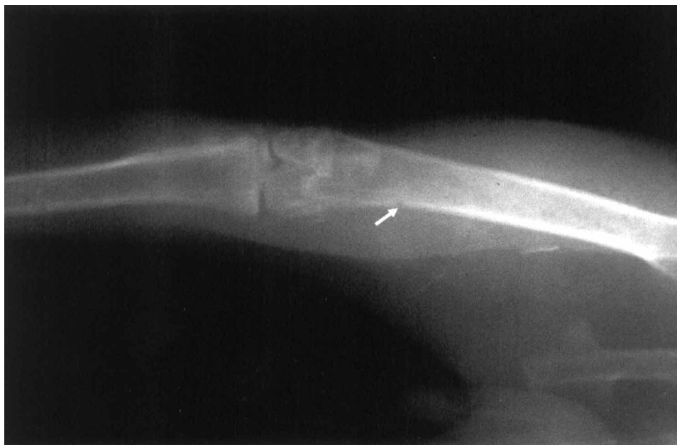
Figure 3. Plain radiography of the right femur. Tiny bone defect at the BIG insertion site is visualized (arrow).