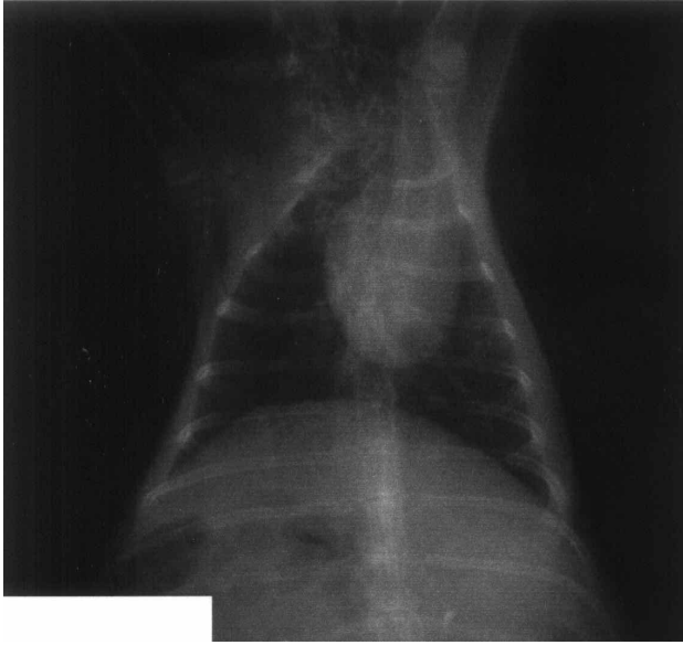
Figure 5. Chest radiography of the rabbit.