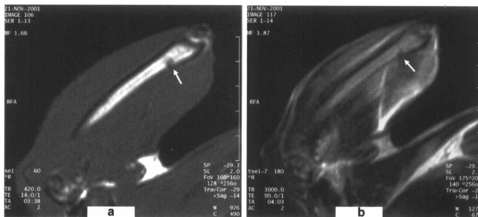
Figure 4. MRI of the right femur. a) T1 and b) T2 weighted spin echo longitudinal images do not reveal any abnormal bone or marrow findings, except for the hypointense site of BIG entrance (arrow).